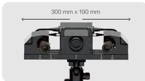
Outer Larger Field of View for scanning medium large objects